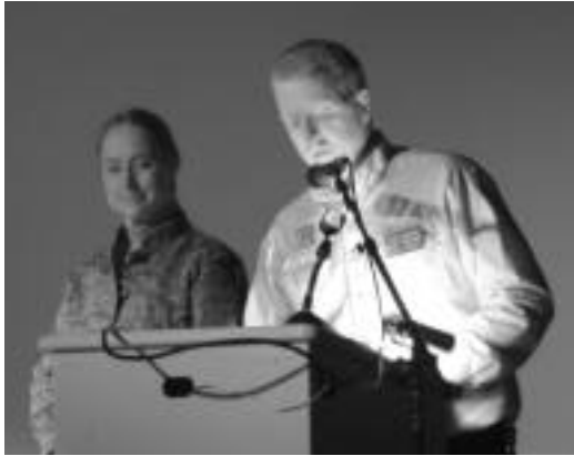
Being introduced to a full house

Focus on Flexibility, Part I - Biomechanical Lecture November 12, 2005