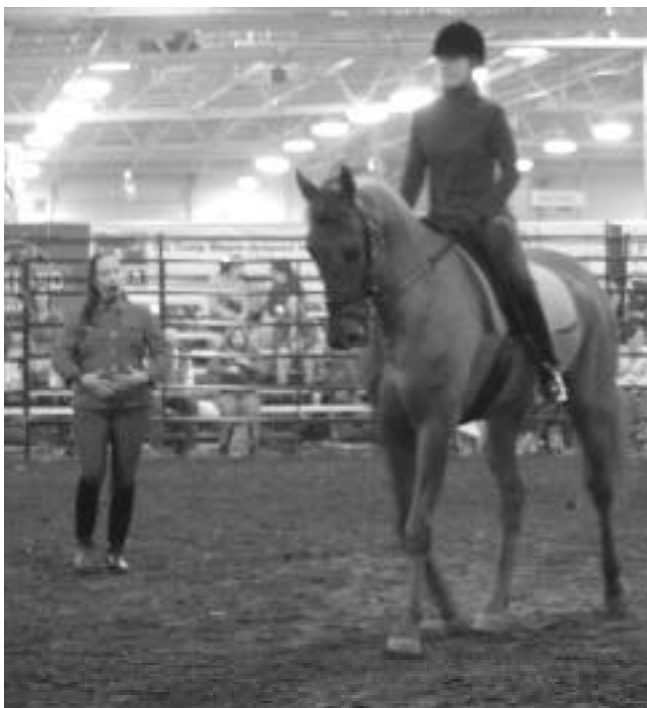
Sandy engages her lower abs properly for a fluid trot