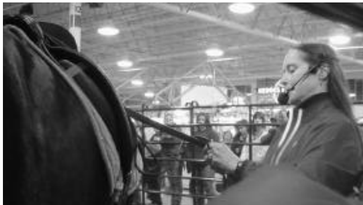
Discussing and adjusting the basic lungeing equipment