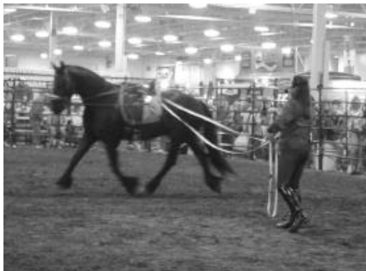
Finally quiet, forward and balanced on the outside rein