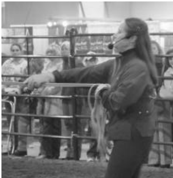
Two hands on the lunge line for control