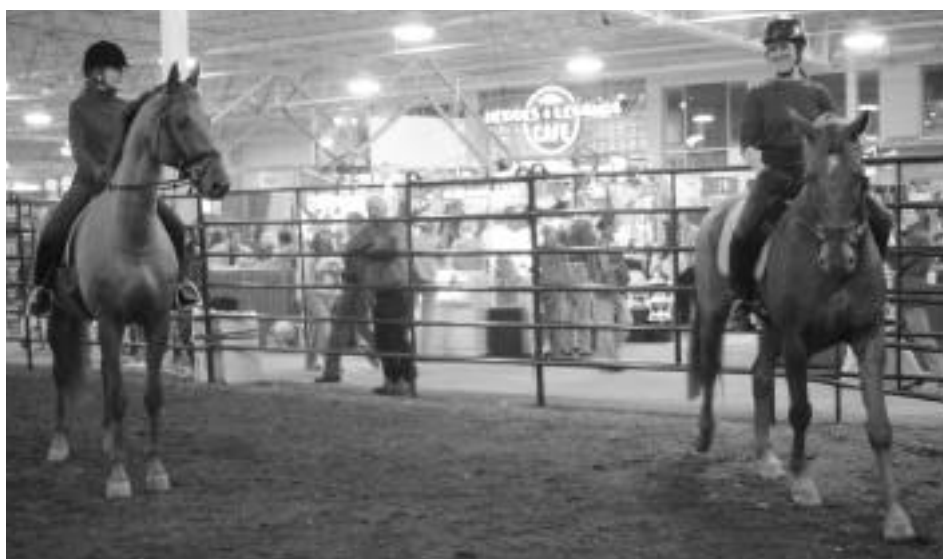
Lots of lights, noise and commotion, but it was all great fun