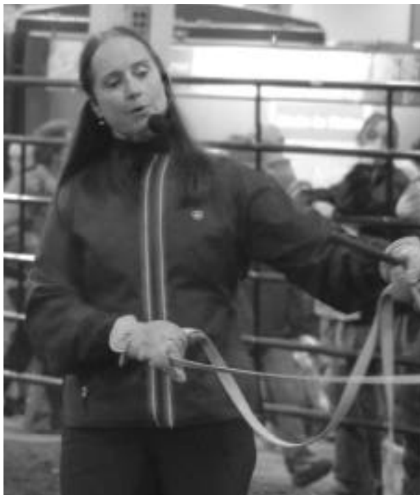
Working the long reins while explaining the biomechanical principles of equine movement