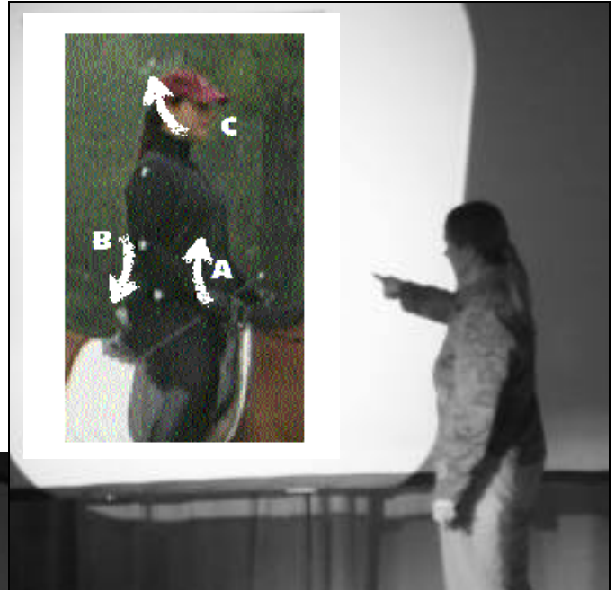
Explaining the dynamic lengthening of the torso